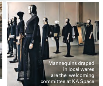
Mannequins draped in local wares are the welcoming committee at KA Space

bergamot, vanilla and ylang-ylang. They're great for relaxing after a long run or tough workout."